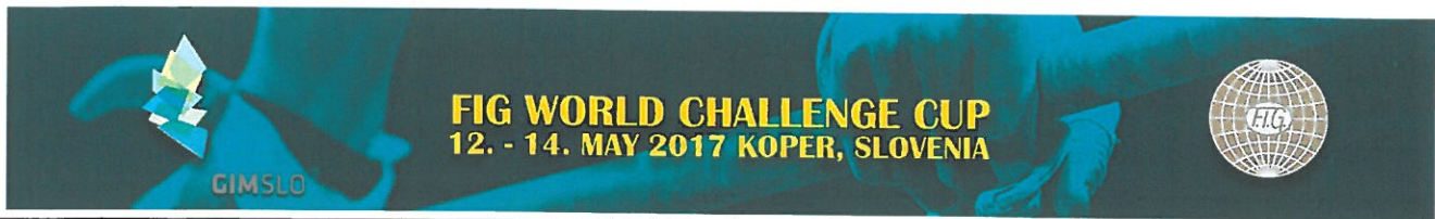
FIG WORLD CHALLENGE CUP 12. - 14. MAY 2017 KOPER, SLOVENIA